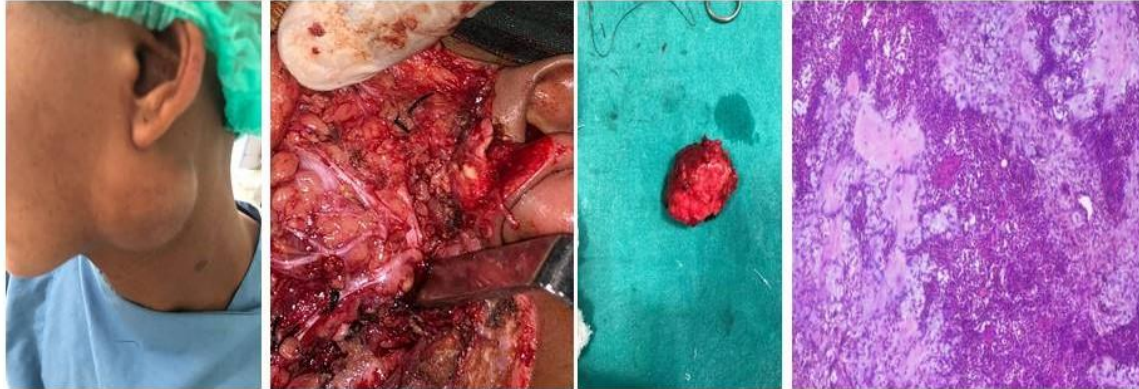
PLEOMORPHIC ADENOMA PAROTID

CASE 1 – Case of pleomorphic adenoma parotid. Histology slide shows epithelial component forming the inner layer of cysts and tubules and myoepithelial cells as the outer layer of cysts and tubules and are scattered within the myxoid stroma.