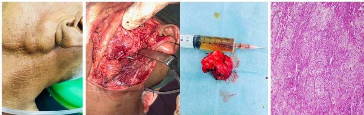
MUCOEPIDERMOID CARCINOMA PAROTID

CASE 5 – Case of Mucoepidermoid carcinoma parotid . Histopathology showed cells arranged in solid , cystic and papillary growth patterns and solid nests , sheets or cords of epidermoid cells. Extracellular mucin pools are seen and varying degree of pleomorphism are noted along with areas of necrosis.