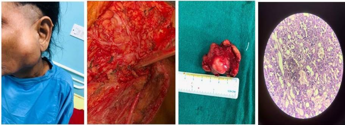
ACINIC CELL TUMOUR PAROTID

CASE 3 – Case of acinic cell tumour. Histopathology showed large and polyhedral cells with basophilic granular cytoplasm. Prominent lymphoid infiltrates with necrosis and mitosis are present.