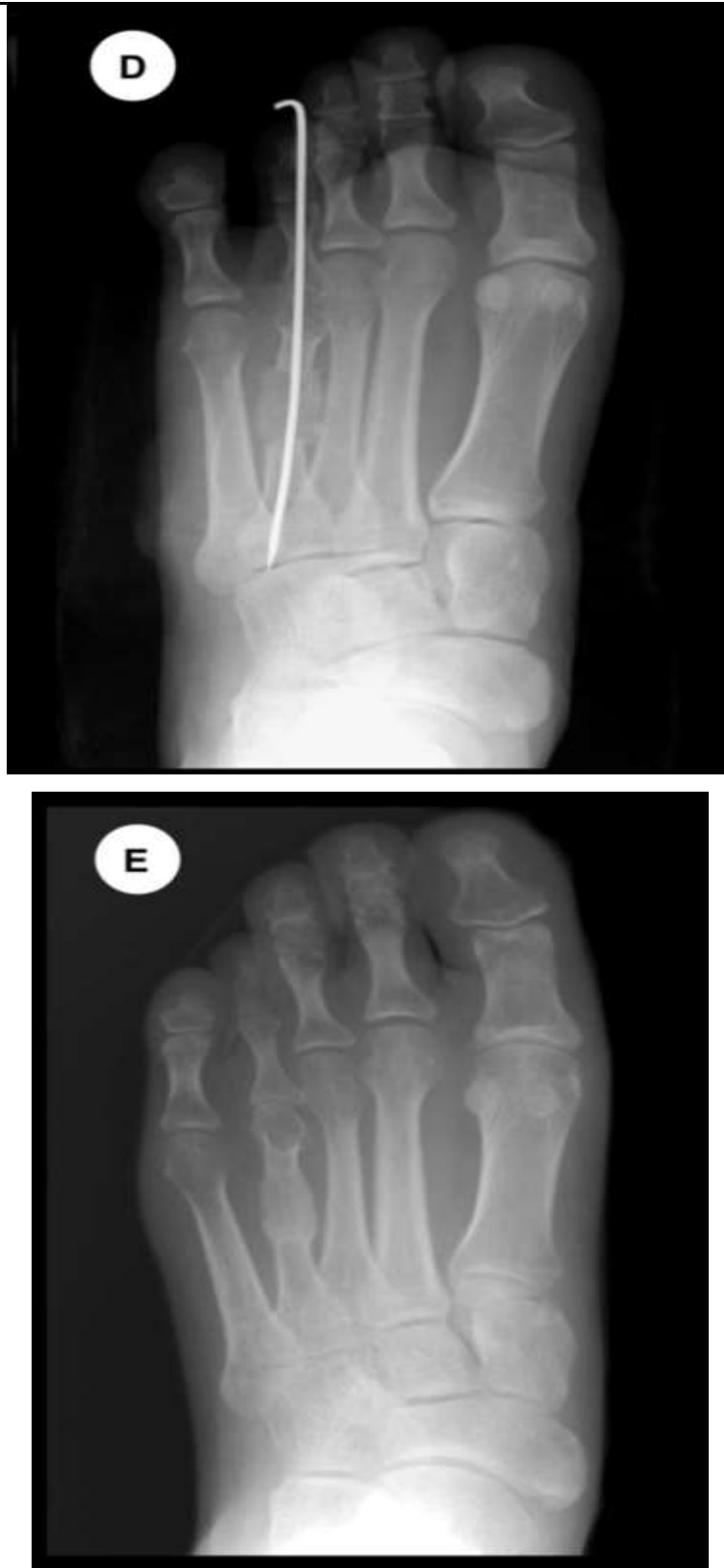
Fig: 1 The radiographs show an anteroposterior view of before and after operation of bone graft.