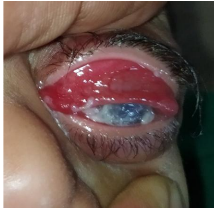
Figure 5. Day 11 photograph of the boy showing increased proptosis, palpebral conjunctiva congestion and corneal keratopathy.