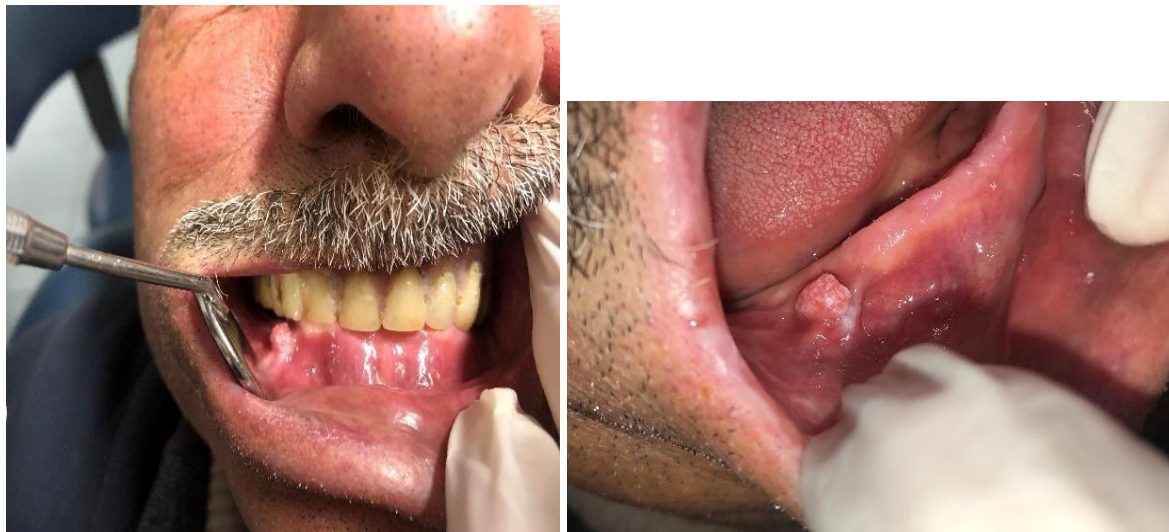
Fig.1-2 Mixed red and white warty growth on the buccal aspect

A 80-years-old male patient visited the Department of Oral Medicine and diagnosis with a chief complaint of a growth on the lower right in mental area in the past 6 months. No relevant medical or family history were contributory. The patient complained from a slow growing region (0.7 cm) which was asymptomatic except during eating. Patient is a heavy smoker and is completely edentulous with only an upper complete denture and nothing on the lower jaw in the past 3 years. OVD is significantly decreased. (Fig. 1-2) During oral examination two symmetrical white patches were found on buccal cheek mucosa. (Fig.3-4). Extra oral examination revealed palpable submandibular lymph nodes (1cm) on both sides. Angular cheilitis is observed on the right side and there was limited in mouth opening.