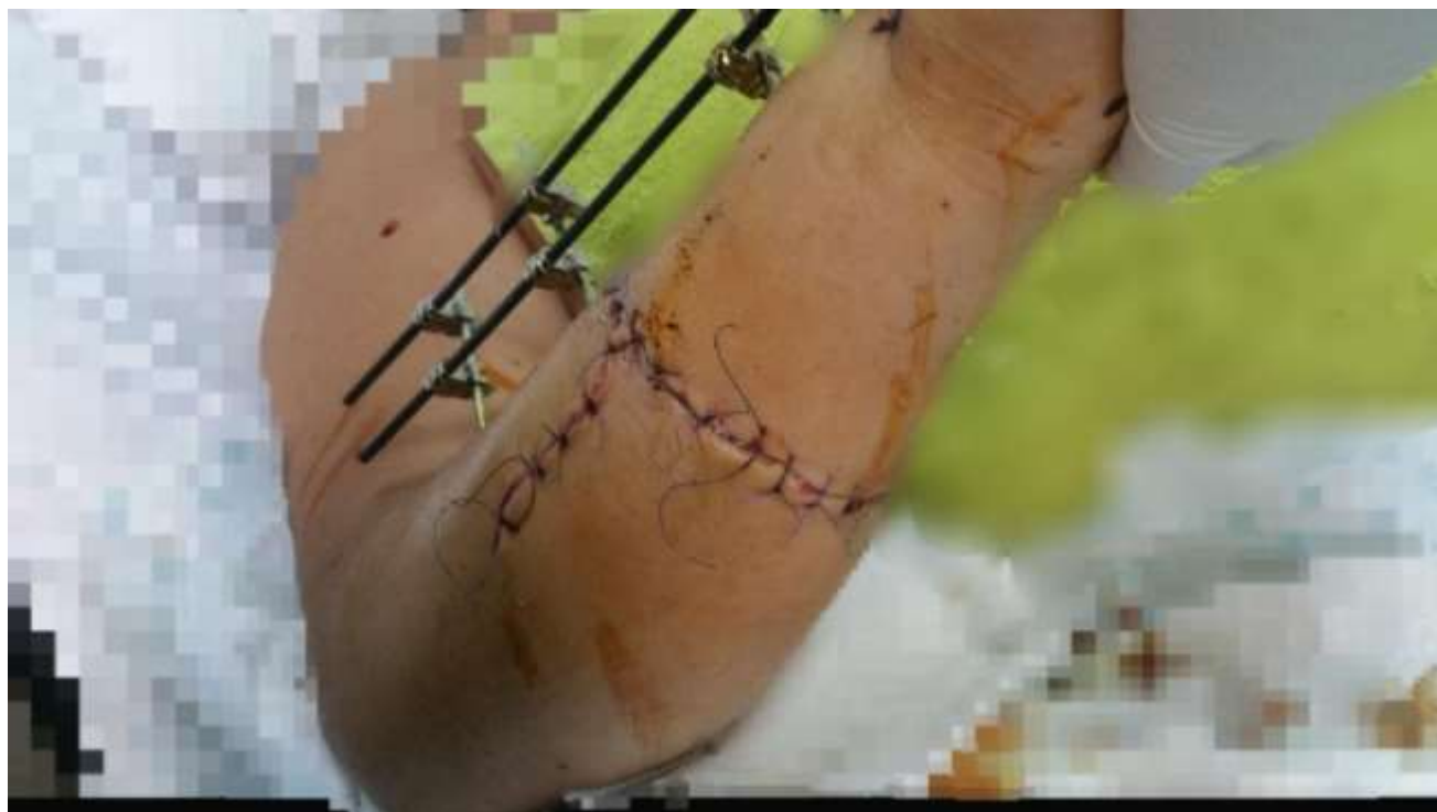
Image 1-6 days post-op