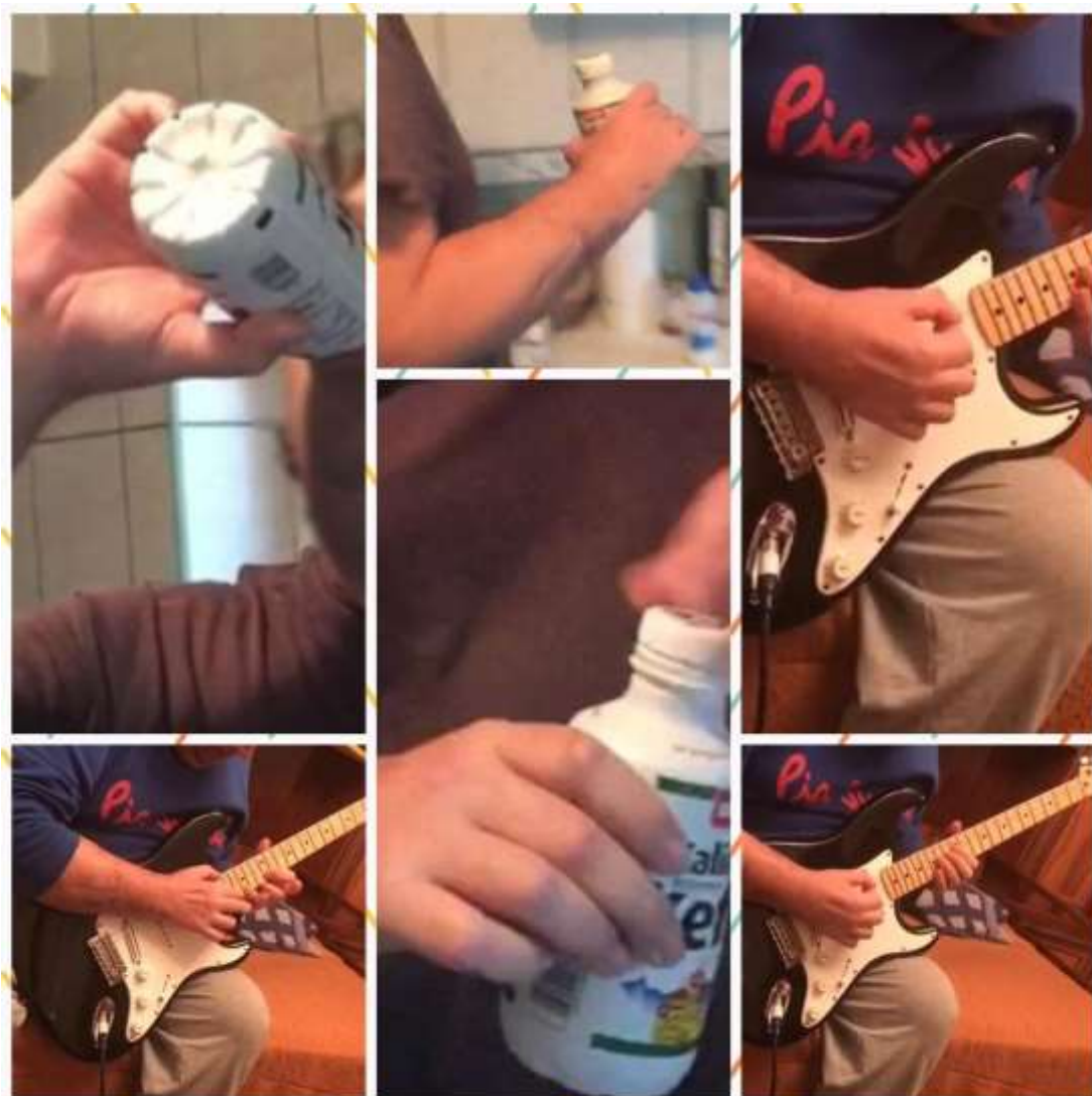
Image 2a-Mobility at 3 months post-op