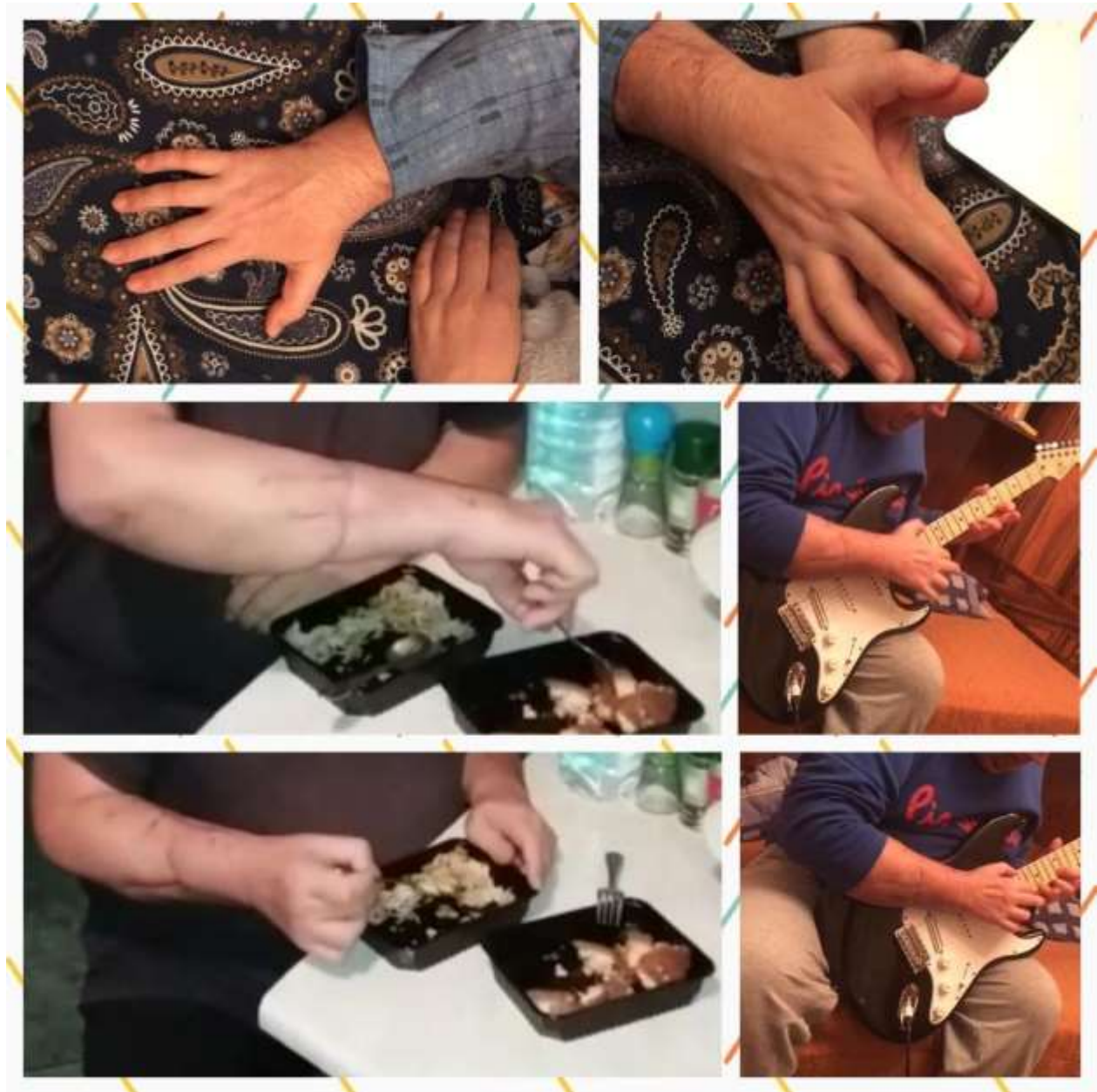
Image 2b-Mobility at 3 months post-op