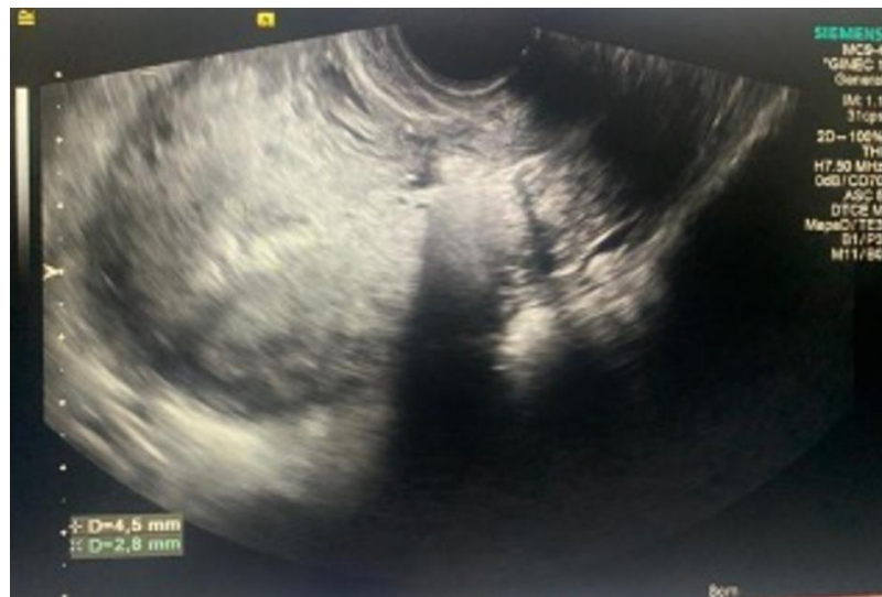
Figure 1: Ultrasound of endometrial cavity

Ultrasound of endometrial cavity with areas with rarefaction phenomenon were observed with endometrial lining of 4.5 mm