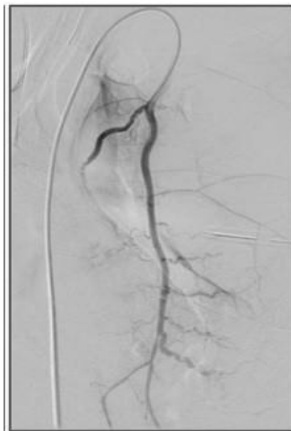
Figure 2 - Post-embolization: Anomalous branches without flow after embolization. Selective catheterization of these branches was done with a 4 Fr vertebral catheter and a 2.8 Fr microcatheter. All vessels were embolized with N-butyl-2-cyanoacrylate mixed with ultra-fluid lipiodol.