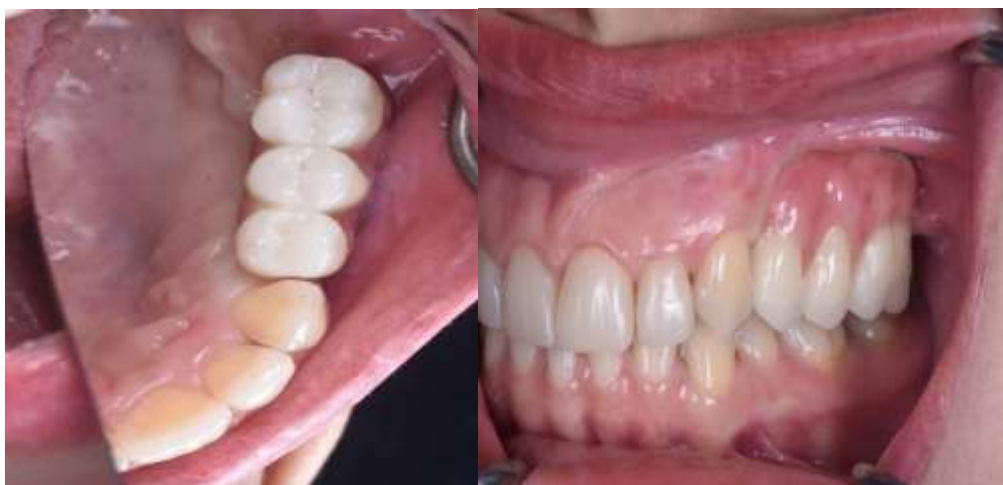
Fig 4: 1. Frontal Intraoral Image: Healthy gingival margins and anterior occlusion.