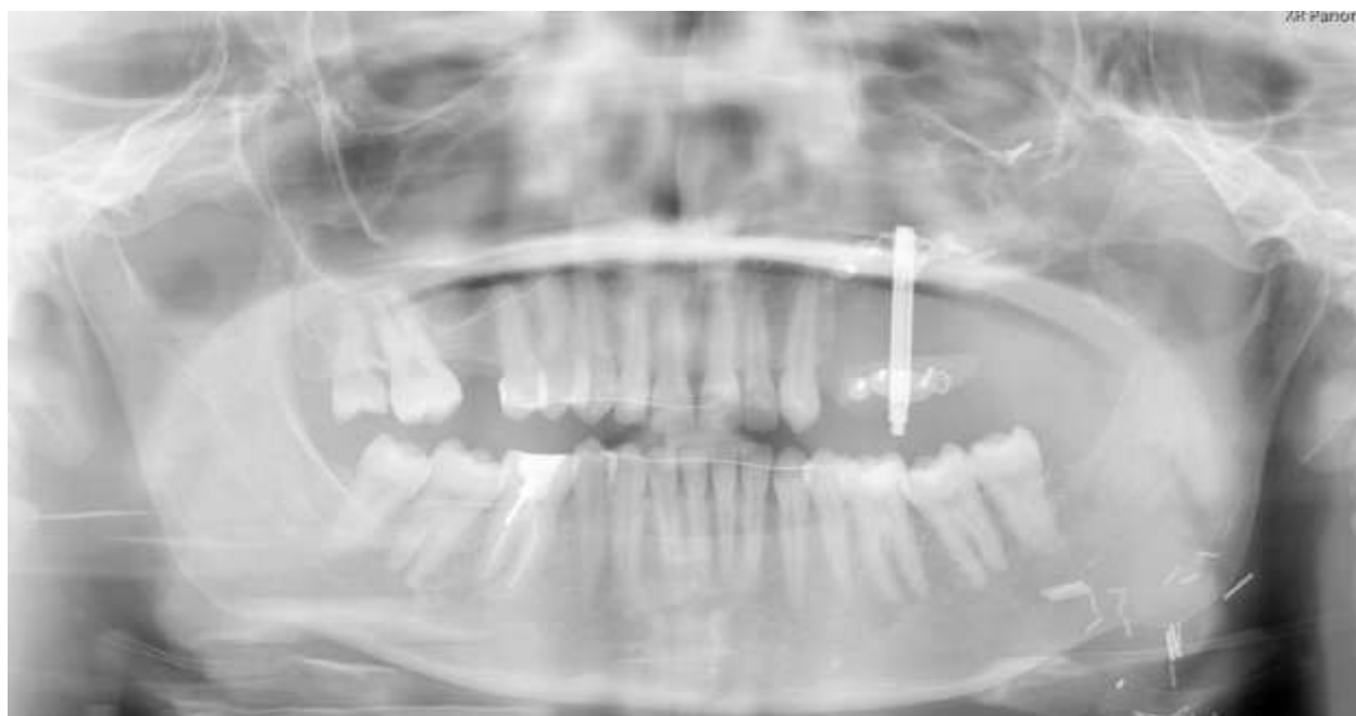
Fig 3: Panoramic radiograph showing vertical distraction device in situ over fibula free flap. The distractor is clearly visualized, demonstrating its alignment and integration with the grafted segment for vertical osteogenesis.