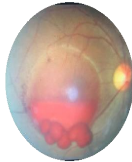
Nd yag hyaloidotomy done